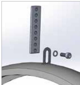
Figure 1: Attach fender bracket to bottom of Fender Flute

CAUTION: Verify that your fender hardware is tight before each ride.