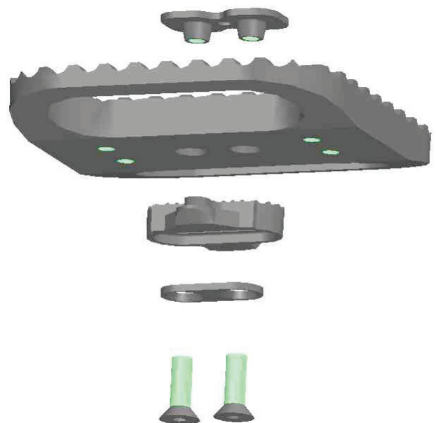
Shimano, Wellgo or Ritchey assembly